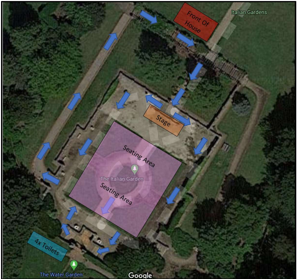
Fig 1a – general layout (inc one way system)