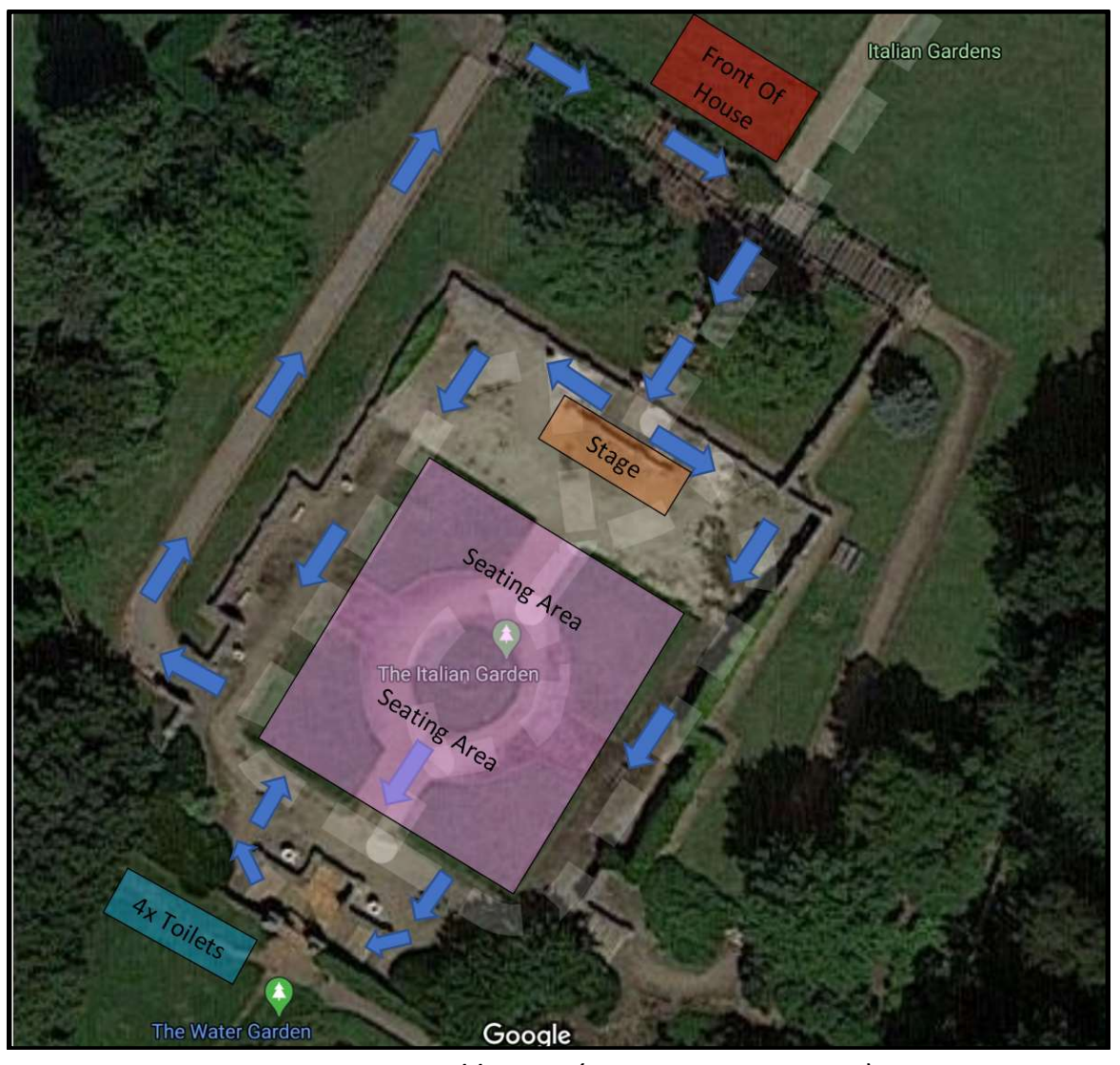
Fig 1a – general layout (inc one way system)